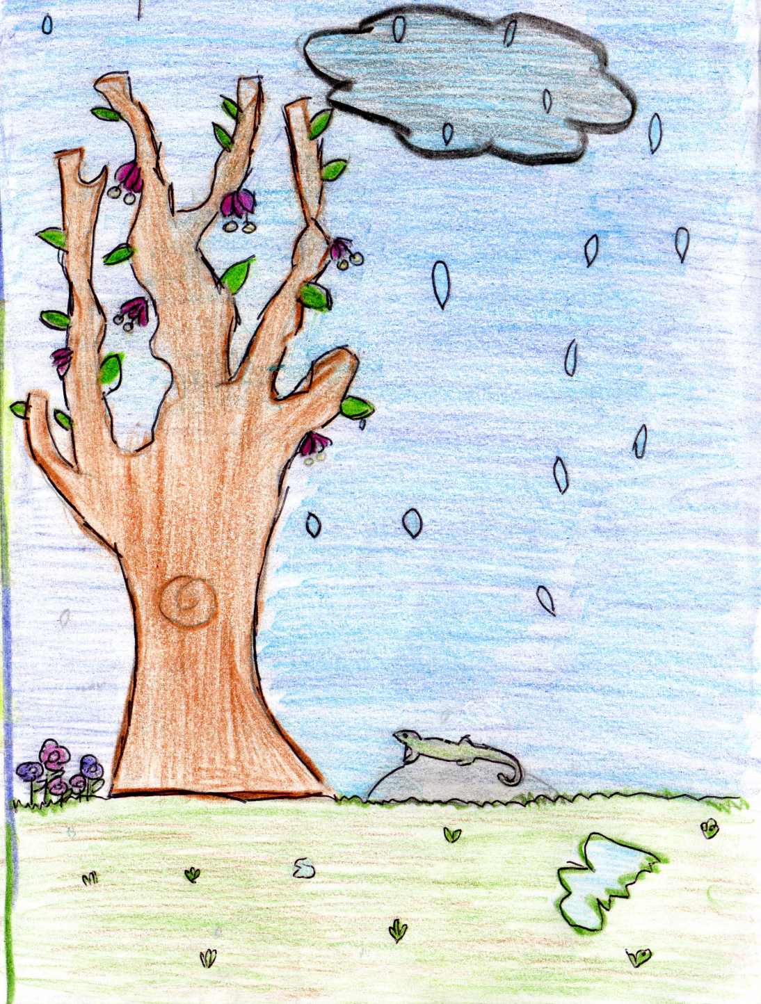
Christmas with the sun and... Easter with the Brand